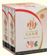
4-Pack 086395 170474