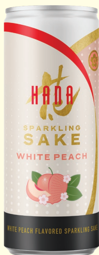
Size: 250 ML Can 086395 170467