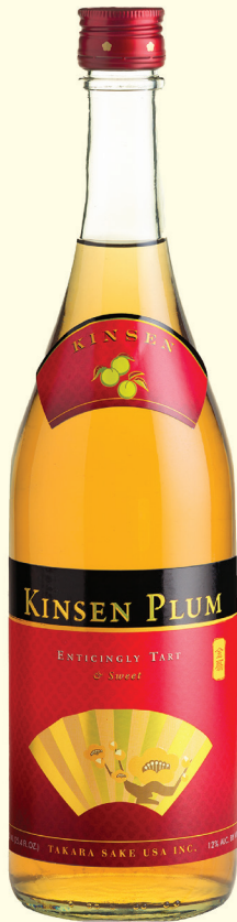
Size: 750 ML / 1.5 L

KINSEN PLUM is an enticingly tart and sweet plum wine, ideal for serving as an aperitif or a dessert wine. KINSEN , or golden fan, is TAKARA'S own rendition of a traditional drink called "ume-shu," enjoyed by Japanese people through the centuries. With refreshing and mouthwatering flavors of summer fruit, this tawny elixir perfectly blends California white wine and ume-based flavors of the renowned plum species cultivated in Japan.